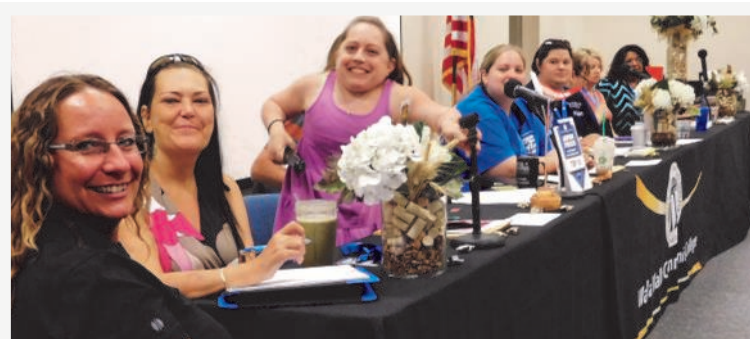
2014-15 STTACC Board