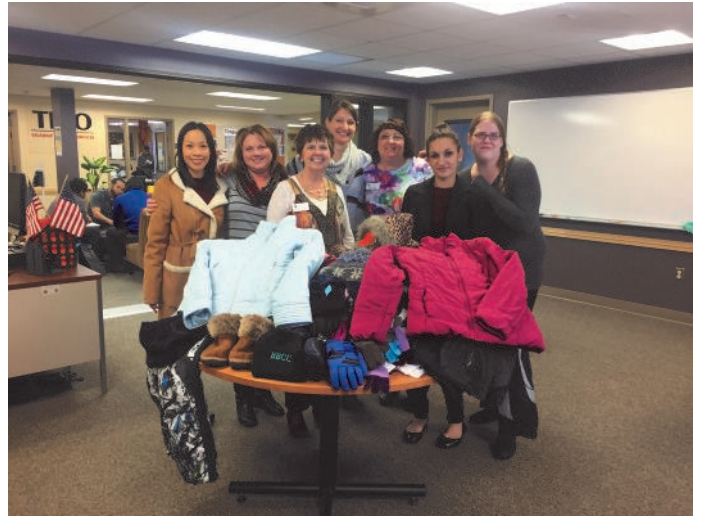
STAR committee having fun and collecting clothing items for the Grant and Adams Foster Card Program.