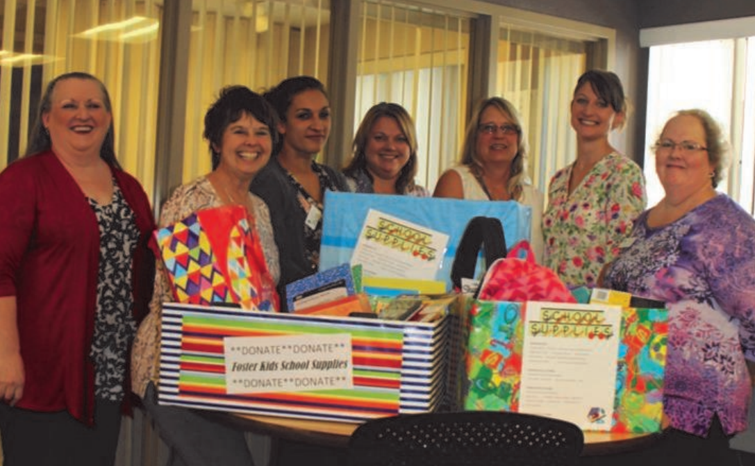
Big Bend Staff Members Collected School Supplies for those in need.