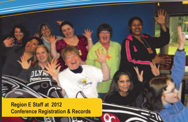
Region E Staff at 2012 Conference Registration & Records